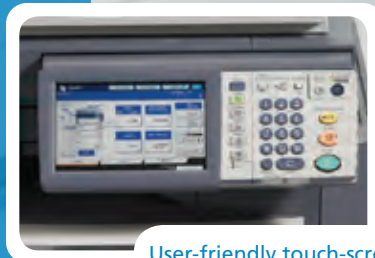
User-friendly touch-screen interface

Maintenance is also faster, easier, and better. It's that way by design. Toshiba's unique easy-to-replace consumable units can be swapped out in seconds, making servicing quick and easy.