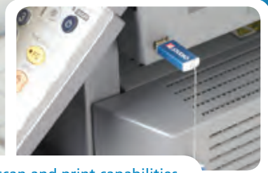
USB scan and print capabilities