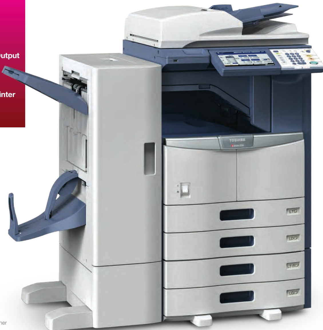
e-STUDIO306 with Saddle-Stitch Finisher