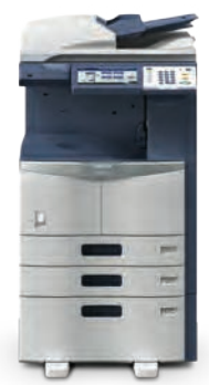
e-STUDIO306 with 2,000-Sheet LCF.