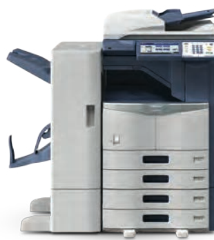
e-STUDIO306 with Saddle-Stitch Finisher.