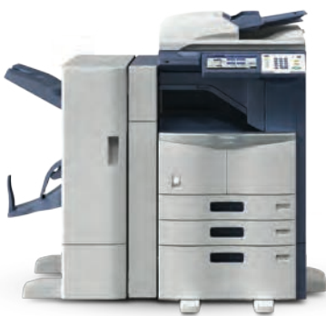
e-STUDIO306 with 2,000-Sheet LCF, Hole Punch, and Saddle-Stitch Finisher.