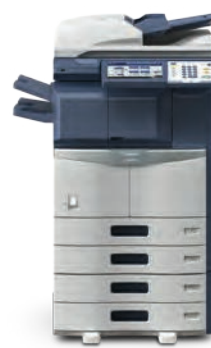
e-STUDIO306 with 50-Sheet Inner Finisher and Hole Punch.